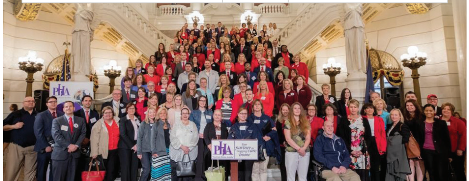
Home care advocates gather on the steps of the Capitol in Harrisburg during the 2017 Lobby Day, sponsored by the PA Home Care Association.